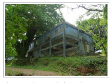
disposing the unexploded ordnance.

On the other hand, the new asset tags are flexible, made out of heavy duty thin aluminum foil with good quality adhesive, and are weather resistant. Additionally, they have barcodes that can be simply scanned when performing regular inventory of assets; as such, making the inventory of assets easier.